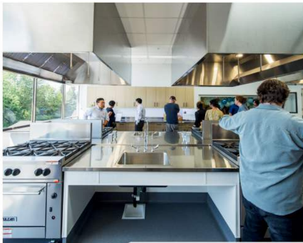
World Relief Community Learning Kitchen at Hillside Church in Kent

Our World Relief Community Learning Kitchen ceremoniously opened in June, and we are now up and running! Over the summer, a group of our interns taught two separate food classes to kindergarten groups during our Refugee Youth Summer Academy, with 20 students in each session.