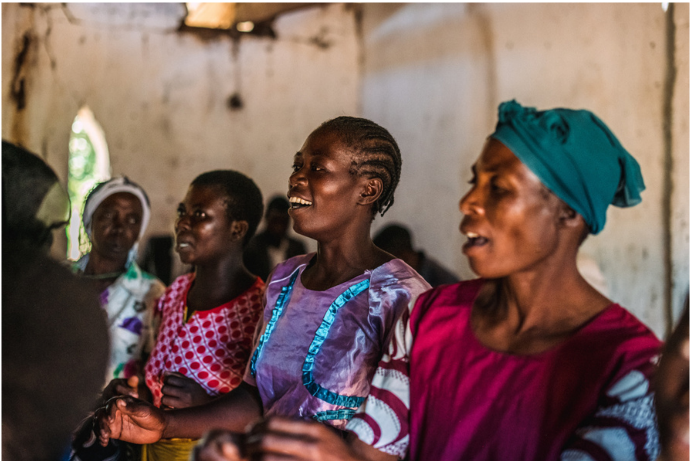
A Sunday church service at Mapiko Village, Salima District, Malawi.

But an end to extreme poverty is possible. The most powerful agent of change in the world already exists; it's the local church. It's God's plan A for transformation. We're inviting you to help unlock the church's potential, to help change the story, and to bring holistic transformation in Malawi.