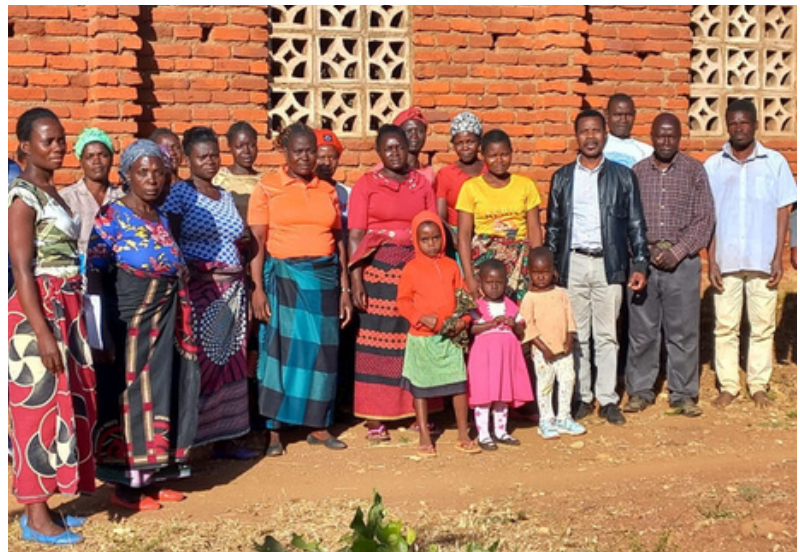
The members of the Nkhulawo Pentecostal Assemblies of Malawi Church are transforming their community with a spirit of compassion and a heart for the most vulnerable.

Together, they decided to plant 20 tree seedlings (costing around $6.50 USD) around the church to prevent strong winds from damaging the roof. Next, they purchased and distributed soap, salt, and school materials to 20 community members, including the elderly, the sick, and local school children from impoverished families. Since then, the church has learned how to produce fertilizer, reducing the costs of growing maize, and has launched savings groups. "What used to be impossible is now becoming possible. We are planning to build a floor for our church with cement using our own resources," shares Pastor Chadika.