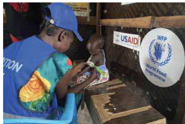
Nutrition screening in Bentiu IDP camp.

We are involved in peacebuilding efforts in Unity State in collaboration with UNDP and the United Nations Multi-Partner Trust Fund. We are part of a consortium comprising five agencies, including UNMISS, the International Rescue Committee, and three national organizations. Our goal is mitigating underlying conflict factors for stability and improved livelihoods. We also focus on enhancing the capacity of judicial and auxiliary agencies to implement peaceful conflict resolution measures. Additionally, we provide resilience interventions that promote social cohesion, offer peace dividends, and make a return to war more costly.