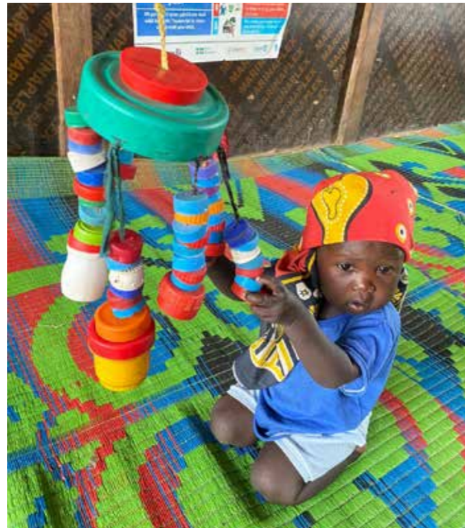
Child playing after nutrition screening at Bentiu IDP camp

✓ We are open and transparent in our operations and reporting. We adhere to the highest standards of quality and accountability, following best practices and guidelines in our sector. We also welcome feedback and learning from our beneficiaries, donors, and partners.