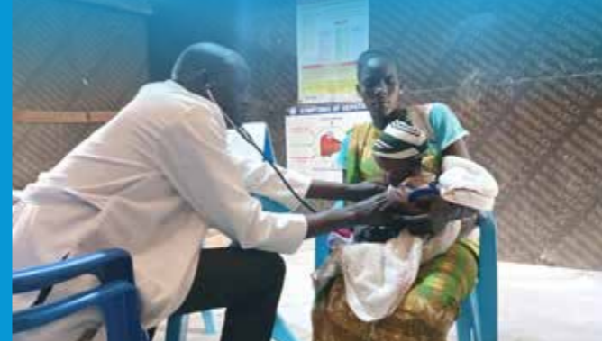
OPD Consultation at Bentiu IDP camp.