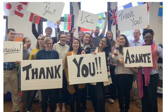
Chicago Office Staff