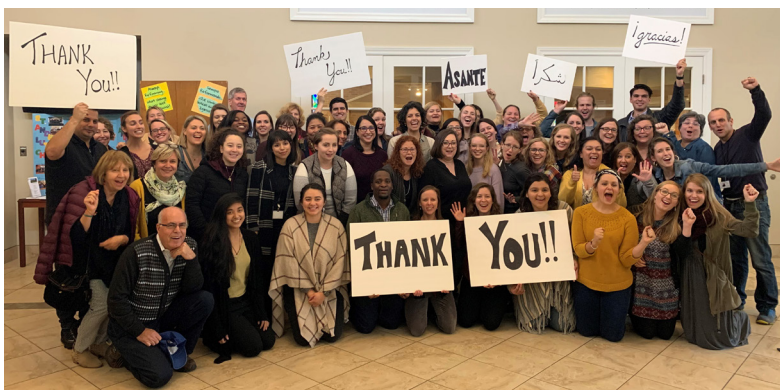
Aurora and DuPage Office Staff

None of this work would be possible without you